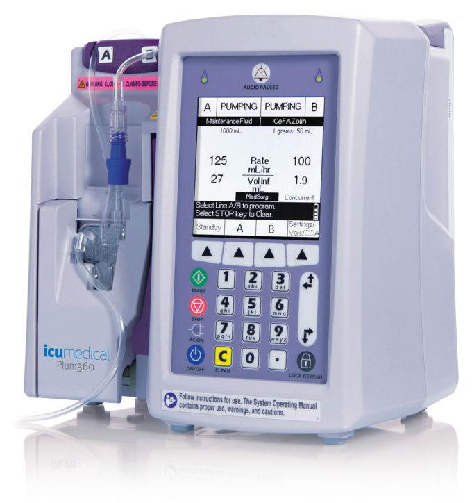
R Only. Please refer to the System Operating Manual for complete operating instructions.

Quick Reference Card Software 15.11 and higher